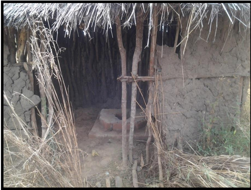
A school toilet before....