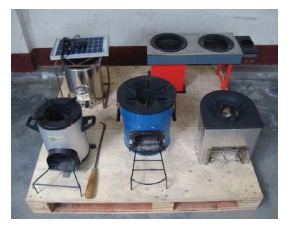
The improved cookstoves used in the Phase One trial, clockwise from top left: Eco-Chula, Prakti, Envirofit, EcoZoom, and Greenway.

ICS fuel efficiency was measured using a three-day kitchen performance test (KPT), widely acknowledged as the best currently available method for accurately estimating daily household fuel consumption. The KPT was carried out using a cross-sectional study design in 116 study households and 24 control households. Two approaches were used to measure the